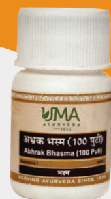
Abhrahk Bhasma(100 Puti)