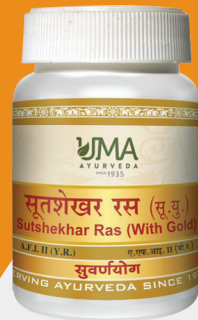
Sutshekhar Ras (With Gold)